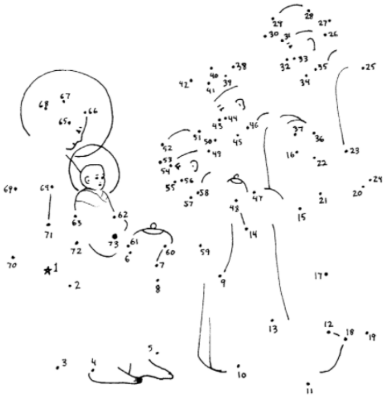
The feast of the Epiphany of Our Lord is a special part of the Christmas season! What are we celebrating on this feast?

When Jesus was dying on the Cross, he told Saint John that Mary would now be his mother. He meant that for all of us as well. Mary is the Mother of God and our Mother! What can you do to celebrate her special day?