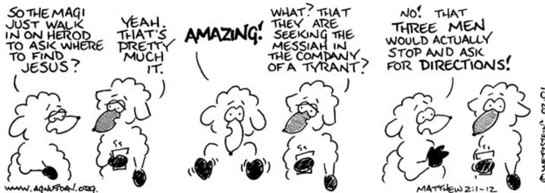
"Agnus Day appears with the permission of www.agnusday.org "

DEADLINE FOR SUBMITTING ITEMS TO BE INCLUDED IN THE BULLETIN IS THURSDAY NOON.