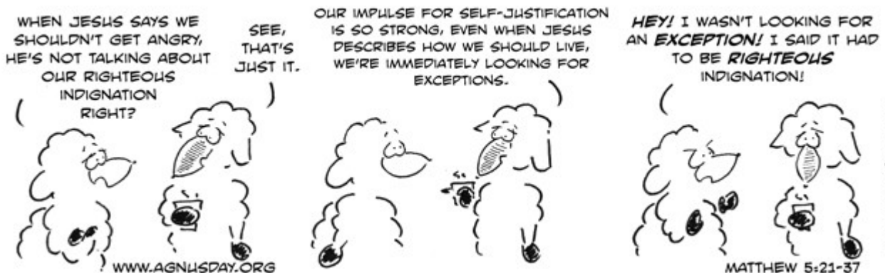
"Agnus Day appears with the permission of www.agnusday.org "

DEADLINE FOR SUBMITTING ITEMS TO BE INCLUDED IN THE BULLETIN IS THURSDAY NOON.