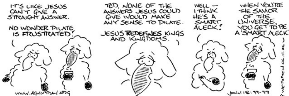
"Agnus Day appears with the permission of www.agnusday.org"

DEADLINE FOR SUBMITTING ITEMS TO BE INCLUDED IN THE BULLETIN IS THURSDAY NOON.