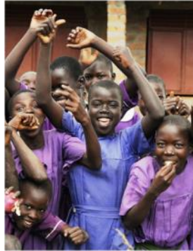
Photo: Children outside of a school in northern Uganda.